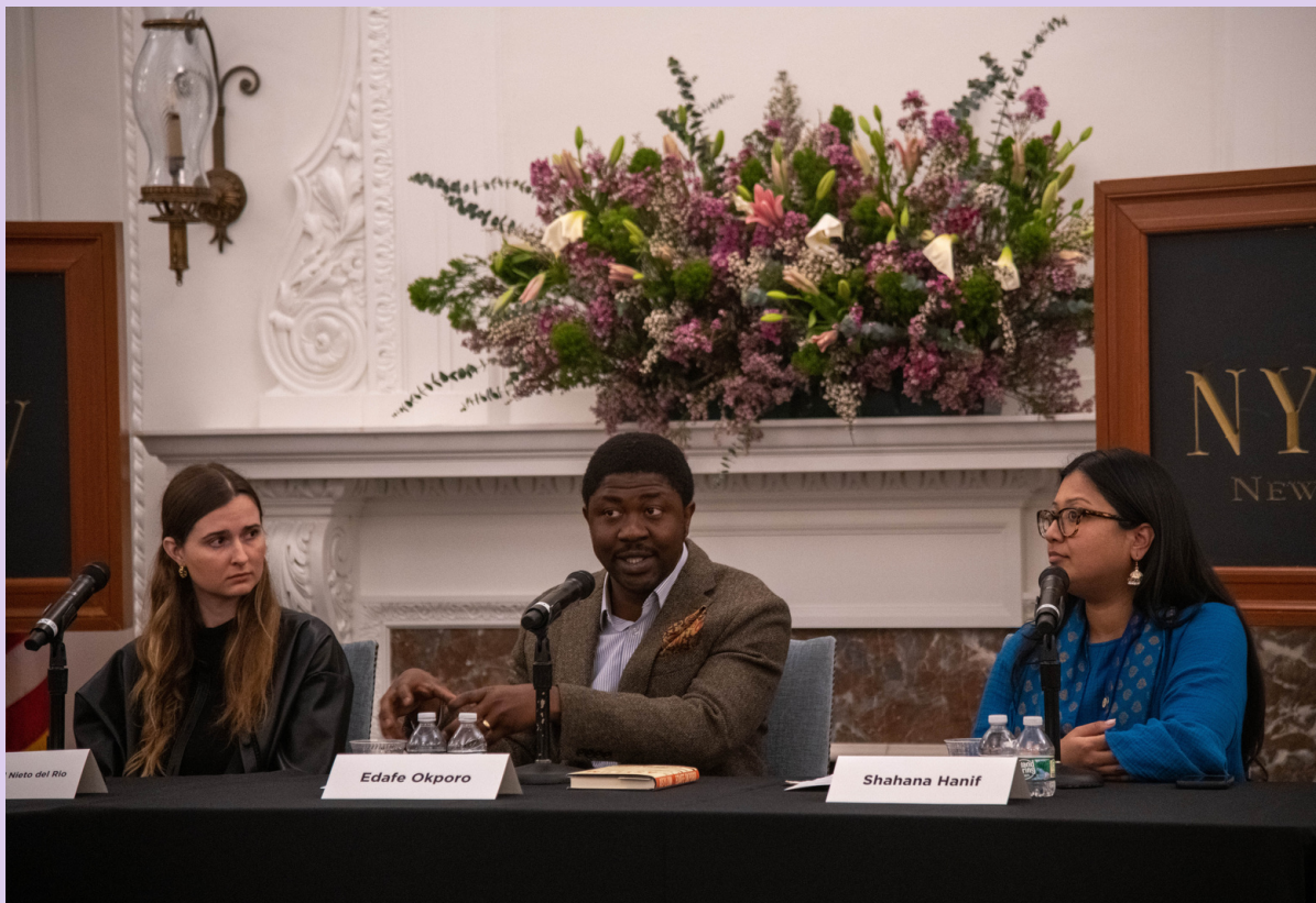
NYU Law School Forum on Asylum, Border Politics, and NYC

We are using the data gathered from interaction with clients who have requested for help to create a guide for welcoming LGBTQ displaced people. Helping organizations understand how to create a welcoming space for displaced LGBTQ people and making them feel welcomed.